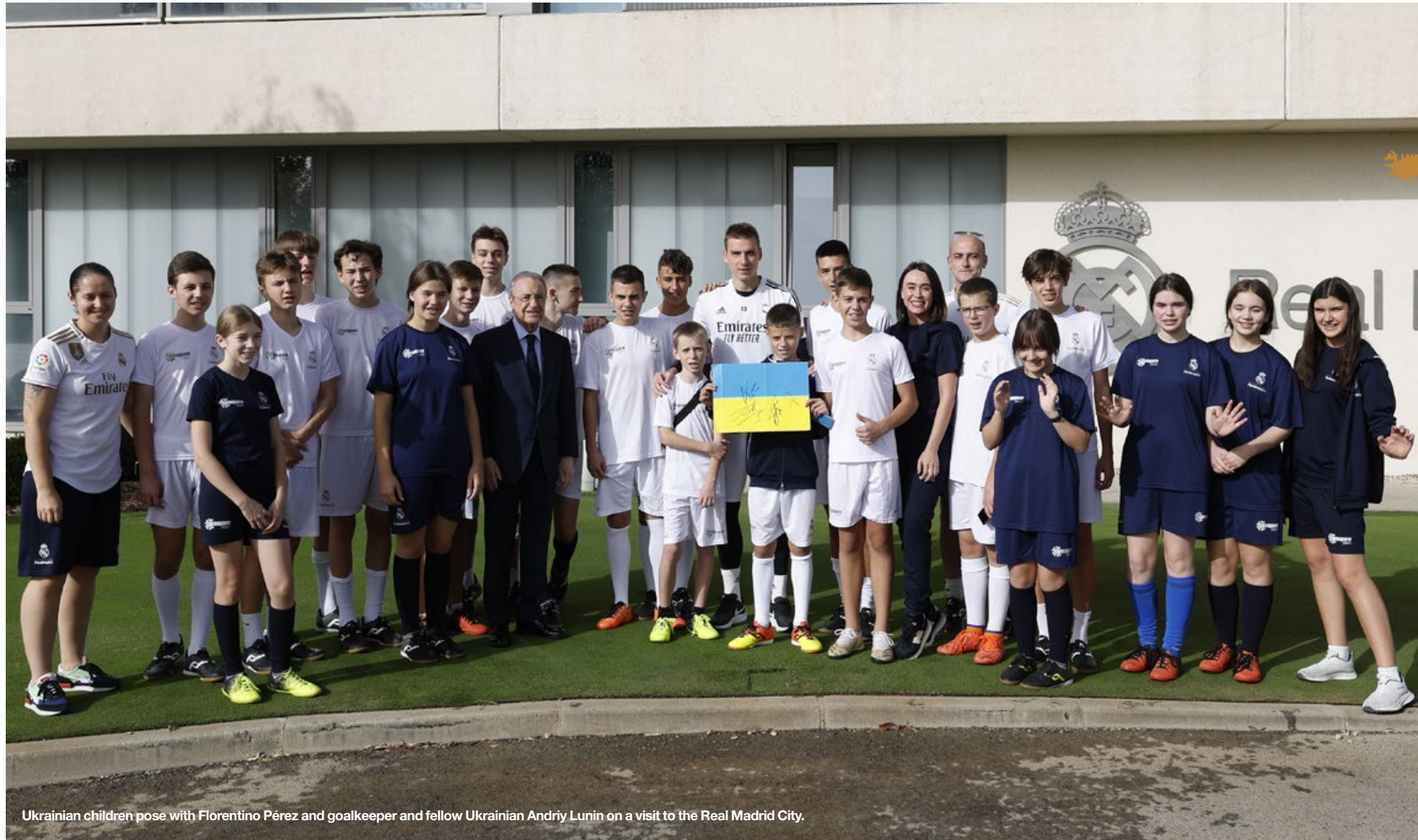
Ukrainian children pose with Florentino Pérez and goalkeeper and fellow Ukrainian Andriy Lunin on a visit to the Real Madrid City.