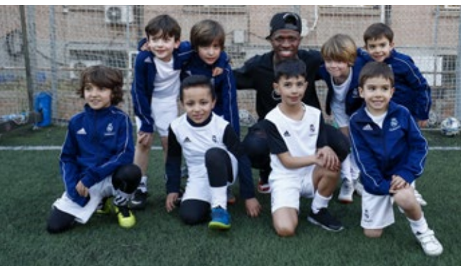
Vini Jr. visits a Foundation social sports school; beneficiaries of the project in Cambodia with Prefect Apostolic Kike Figaredo and a beneficiary getting a physical in Honduras.

With more than 900 programs, projects, and activities each season in its quarter century of existence, the Foundation has benefited more than 1.5 million people, focusing its work on organizing social and sports activities that combine athletics and values