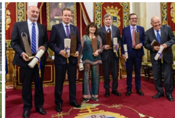
In the images, joint events with the Foundation and EMT, ASICOM, ONCE, and ACPI (Ibero-American Press Correspondent Association).

ro-American Award for its humanitarian, social, and educational work to contribute to the advancement of this historic region. The award was granted by the Ibero-American Communication Association (Asicom) in collaboration with the University of Oviedo and Interprotección/Interprotection. The award was collected by Ricardo Gallego, Foundation ambassador, who spoke to the fact that the institution has been running “social sports projects in the field of education, integration of groups at risk of exclusion, and development cooperation” for 25 years.