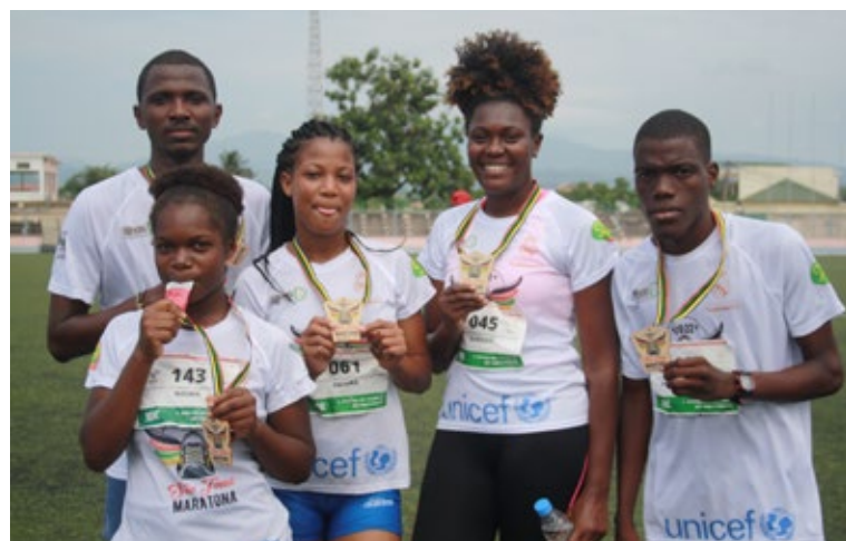
Participants in the 2 nd São Tomé Maratona.

Two hundred runners from 15 different countries participated in the second year of this charity run