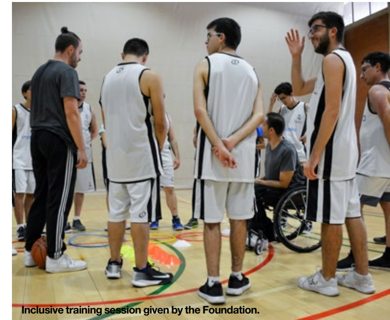
Inclusive training session given by the Foundation.

Outside of the Community of Madrid, a new social sports football school for integra-