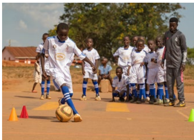
A group of students during a practice session at the Foundation's new school in Kampala, Uganda.

The Real Madrid Foundation has launched a new social sports school at the Naguru Katali elementary school in Kampala, Uganda that will benefit more than 150 children