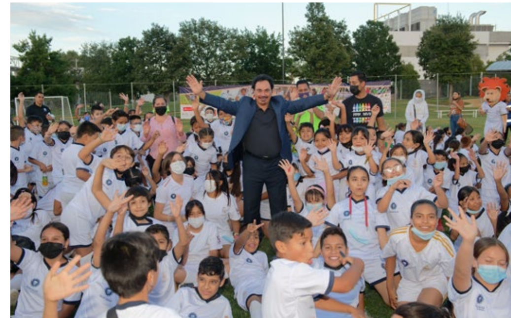
Former Mexican football player Hugo Sánchez, with the participants of the "2022 Úne-T Tournament: For Better Mexicans".

A total of 500 boys and girls, beneficiaries of the Foundation's social sports schools in Chihuahua, participated in the "11 th Úne-T Tournament 2022: