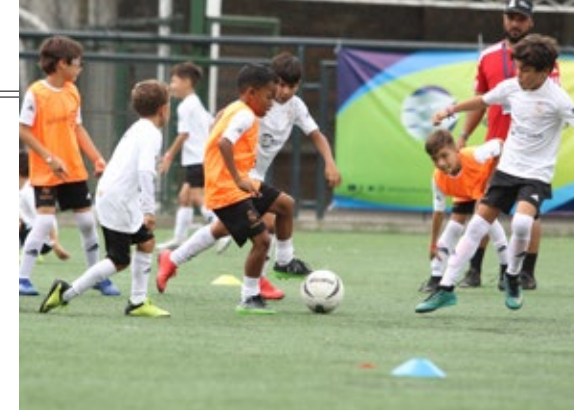
From left to right and top to bottom, participants in the clinics in Portugal, Venezuela, Canada, the United States, and Japan.