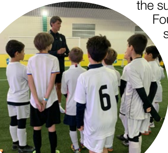
Participants in the clinics in Brazil.

The scope of the Annual Football Program has grown and at the same time the number of venues and participants in the clinics on the different continents increased substantially over the summer, contributing to the sustainability of the Foundation's social sports projects