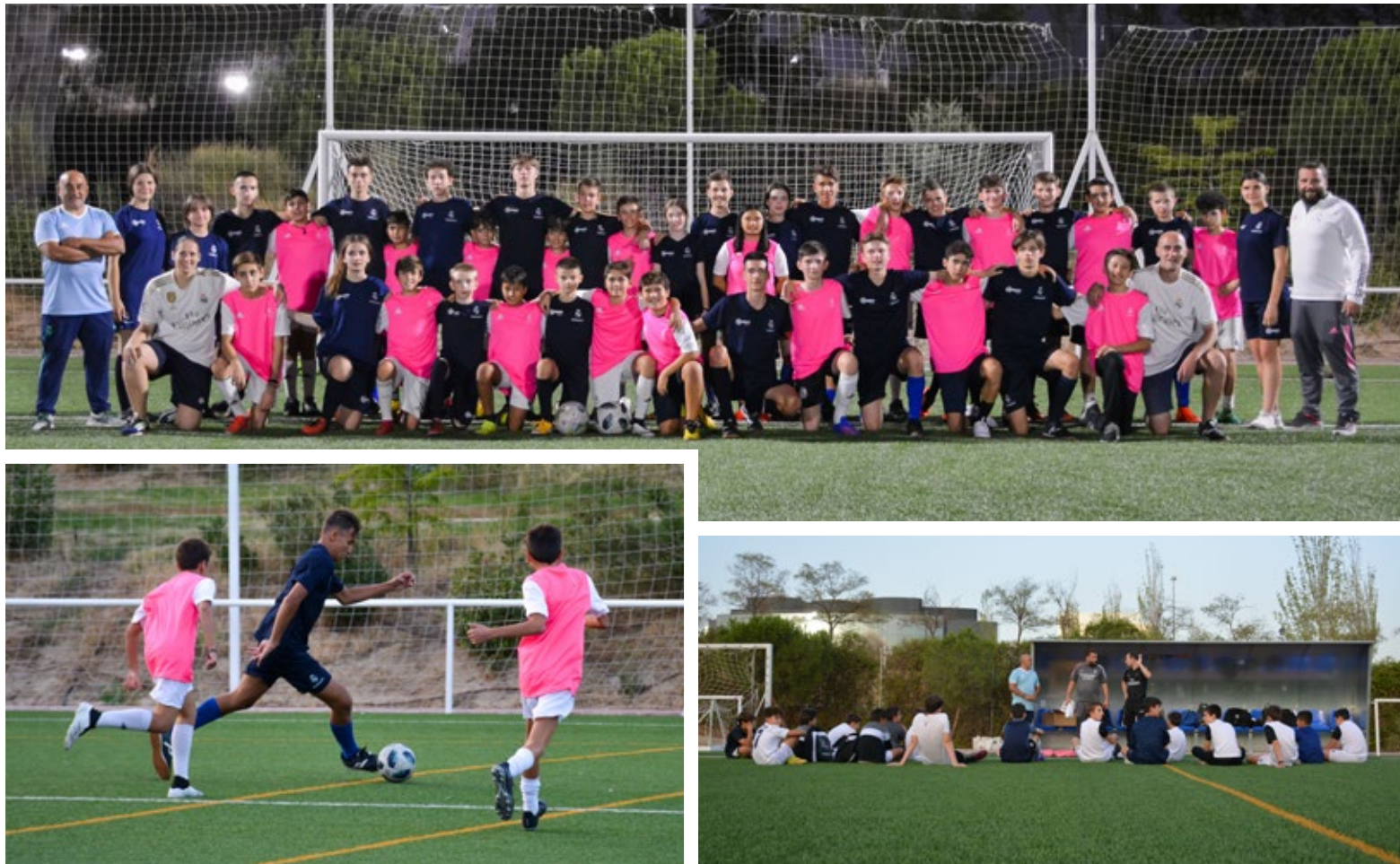
Real Madrid Foundation students and coaches excited to start to begin practice at the start of the 2022-2023 season.