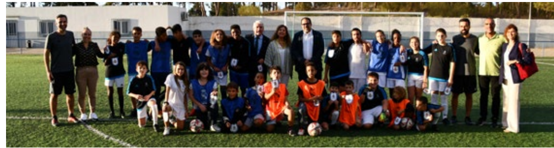
A group of girl beneficiaries of the Portuguese social sports school.