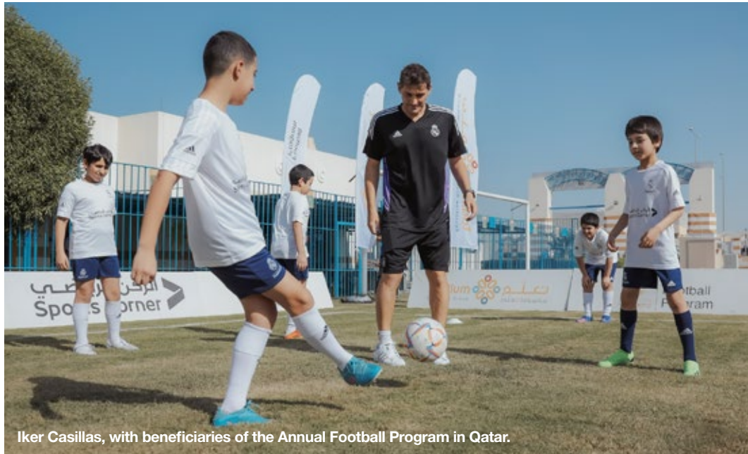
Iker Casillas, with beneficiaries of the Annual Football Program in Qatar.