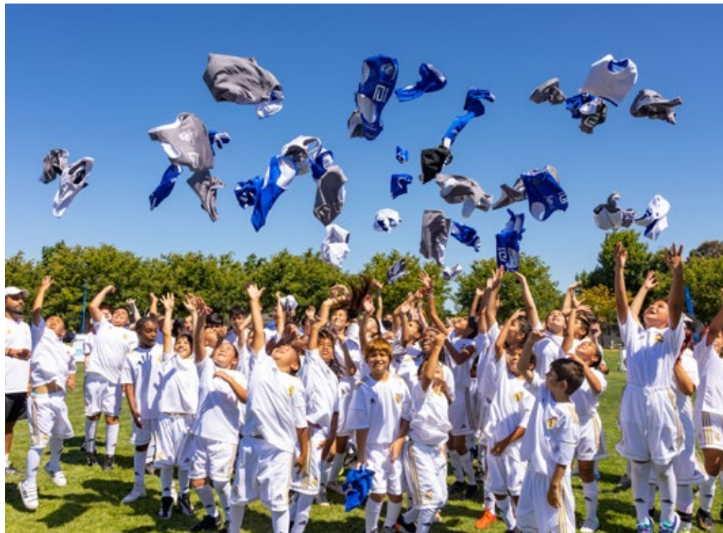
Participants in the clinic held in Stockton, United States, in collaboration with Abbott.

Since last season, Abbott has partnered with the Foundation by promoting nutrition for health and helping to promote education, sports, and wellness to help at-risk children in 80 countries. The aforementioned clinic stems from Abbott's commitment to the city of Stockton and its Future Well Communities program, launched in 2019. This initiative unites communities with leading institutions such as the University of the Pacific, the Council, and the Emergency Food Bank to promote healthy living among people with diabetes. ❖