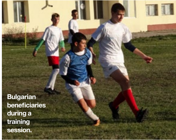
Bulgarian beneficiaries during a training session.