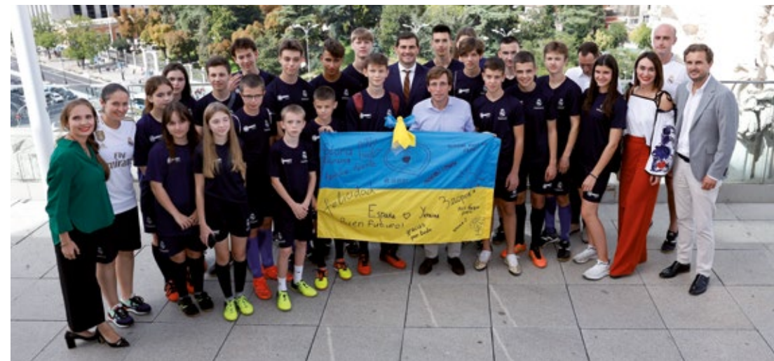
Mayor José Luis Martínez-Almeida received the Foundation's Ukrainian students at the Cibeles Palace, seat of the Madrid City Council.