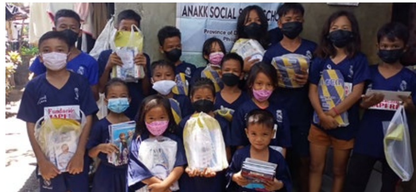
A group of Philippine students from the Real Madrid Foundation receive school supplies with the collaboration of the Mapfre Foundation and the local NGO Anakk.

a very exciting moment for the 200 children at risk of social exclusion who receive sports and values sessions in towns such as Santa Cruz de Davao, Digos, Hagonoy, and Padada.