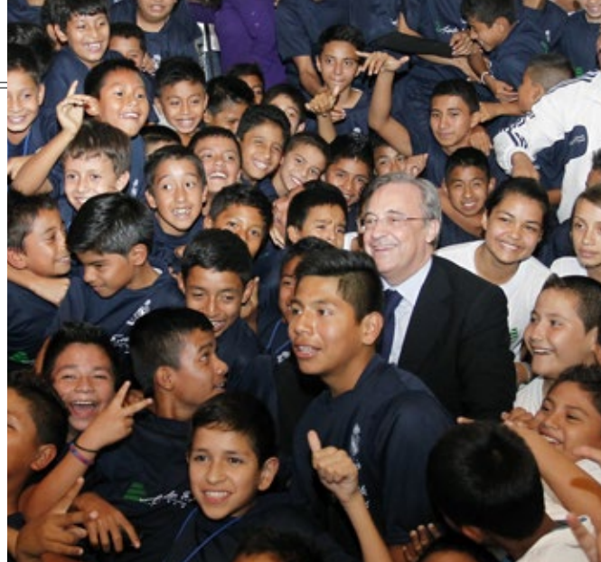
Florentino Pérez with beneficiaries from Guatemala. Visits by players to social sports schools, including those at penitentiaries and juvenile facilities. Inclusive projects with the elderly and on comprehensive education.

These projects, both ongoing and one-off, are built off of the work of the international partners who carry out the activities, the collaboration of patrons and sponsors, and the thousands of Real Madrid fans who sup-