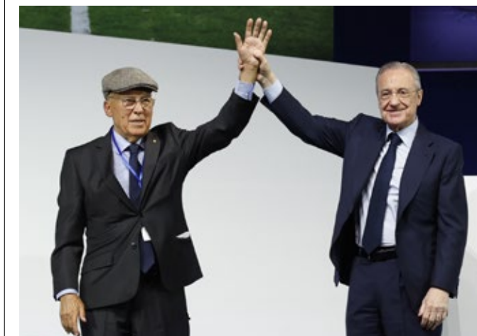
Amancio Amaro was unanimously appointed honorary president of Real Madrid at the Extraordinary General Meeting.

Publication and distribution: EDICIONES REUNIDAS, S.A. GRUPO ZETA REVISTAS CORPORATIVAS c/ Pedro Muñoz Seca, 4 (4ª planta). 28001 Madrid Phone: 915 863 300.