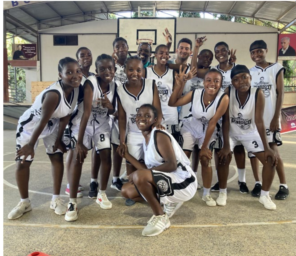
Clockwise, the Real Madrid Foundation's online training in Angola, beneficiaries in Tanzania, and on-site training of coaches in Mozambique.