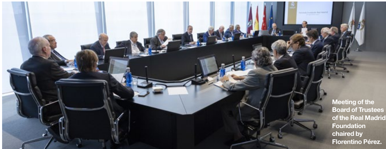
Meeting of the Board of Trustees of the Real Madrid Foundation chaired by Florentino Pérez.