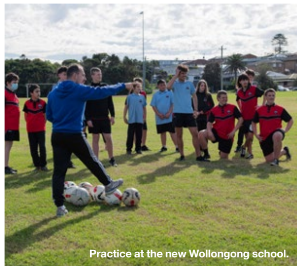
Practice at the new Wollongong school.

The Real Madrid Foundation has opened its second social sports school in Australia in the town of Wollongong (in the southeast of the country), with the collaboration of the New South Wales Department of Education. The project has a hundred beneficiaries and operates at the Warrawong High School as part of the tutoring program for students experiencing difficulties. The school has students from 39 different countries.