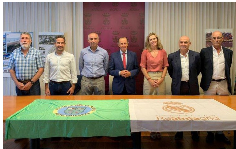
Institutional presentation of the new social sports school in Chiclana.

The Real Madrid Foundation signed an agreement with the municipal institutions of the city of Cadiz and with the Novo Chiclana Football School to start running a football project for integration