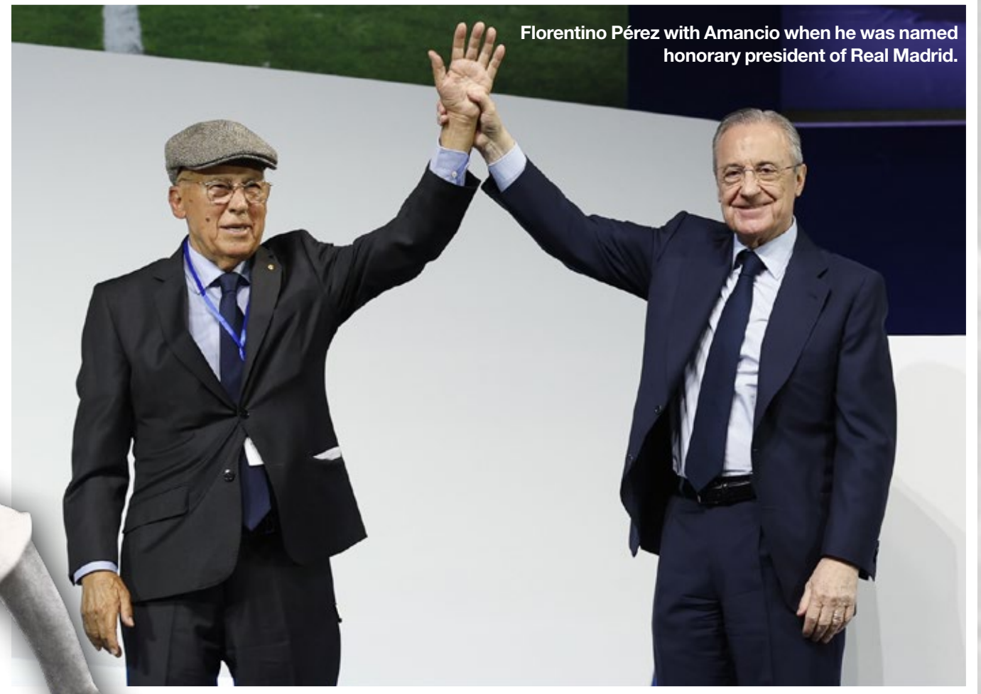
Florentino Pérez with Amancio when he was named honorary president of Real Madrid.