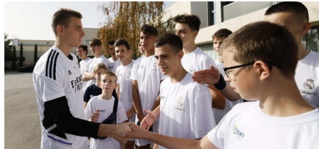
Real Madrid president Florentino Pérez and goalie Andriy Lunin welcomed the Ukrainian delegation, who posed with the club's latest trophies.