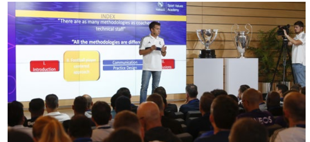
One of the training sessions available on the e-learning platform.

and content sections for educators, players, and parents. This window to the world received the Top Developer Award 2021 for its content's innovative and social nature. Adidas' support for the Real Madrid Foundation also includes donations of materials for some lines of projects each season, such as the program to help homeless people become active members of the community. ↔