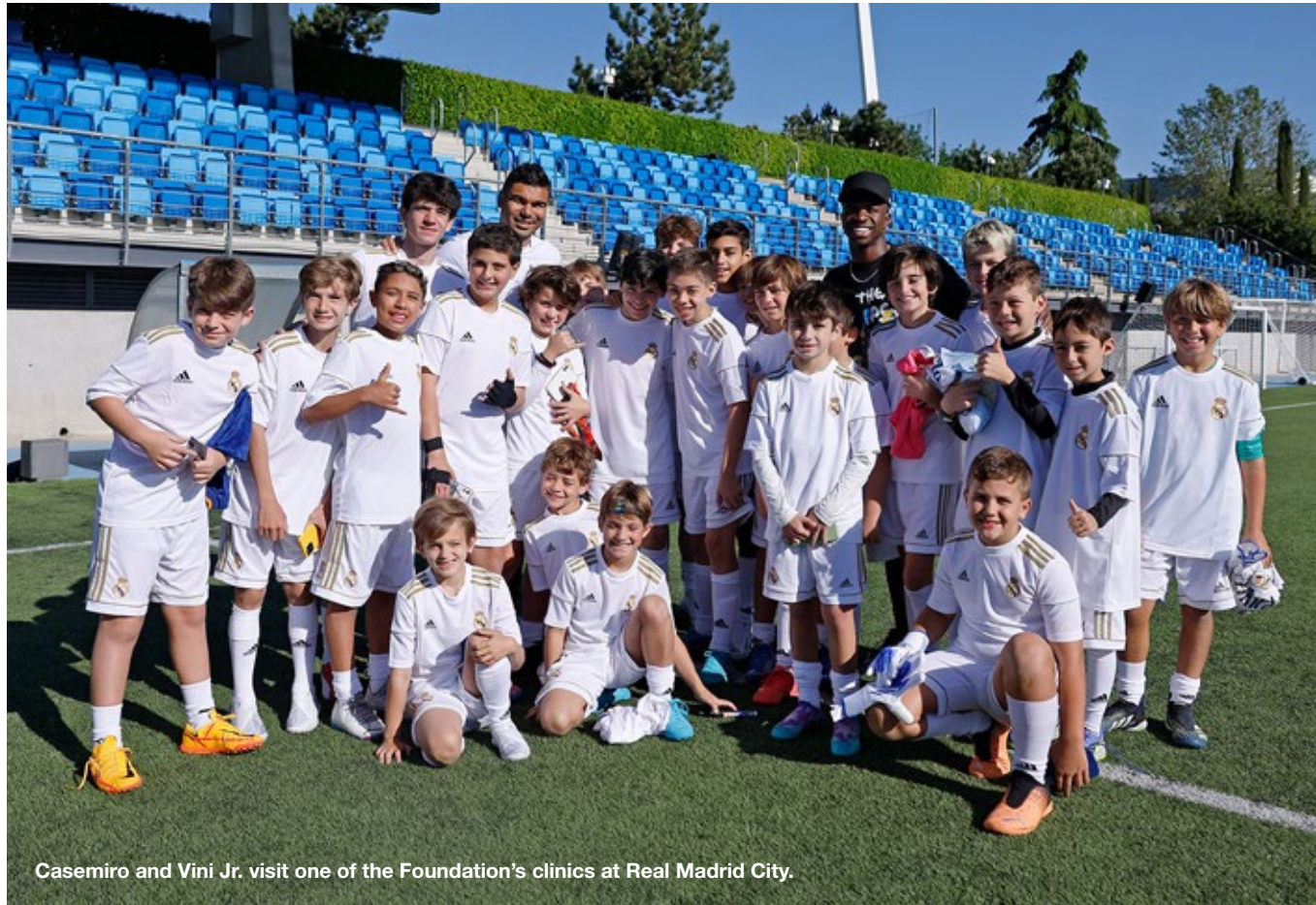
Casemiro and Vini Jr. visit one of the Foundation's clinics at Real Madrid City.