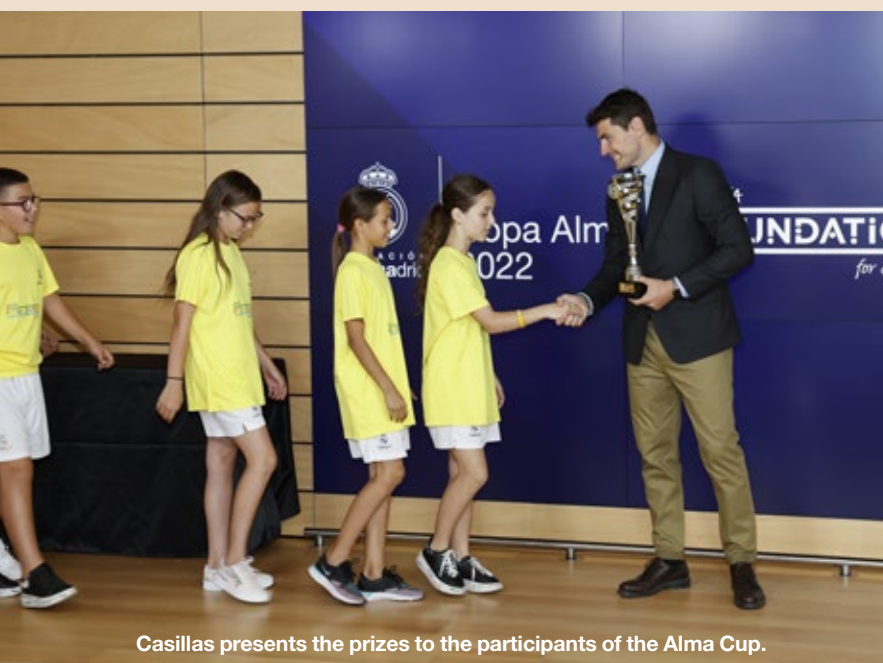
Casillas presents the prizes to the participants of the Alma Cup.

their understanding of respect, and the members of the Bulgarian team stood out for their healthy habits. The team from the Moroccan project was especially motivated. The Portuguese projects represented shared the awards for empathy (Guimarães), independence (Vila Real de Santo Antonio), and self-esteem (Manique). The Spanish team won the award for the team with the best good sportsmanship. All of them experienced a day of cultural, social, and sports exchange, which for them was a unique and unforgettable experience. ♦♦