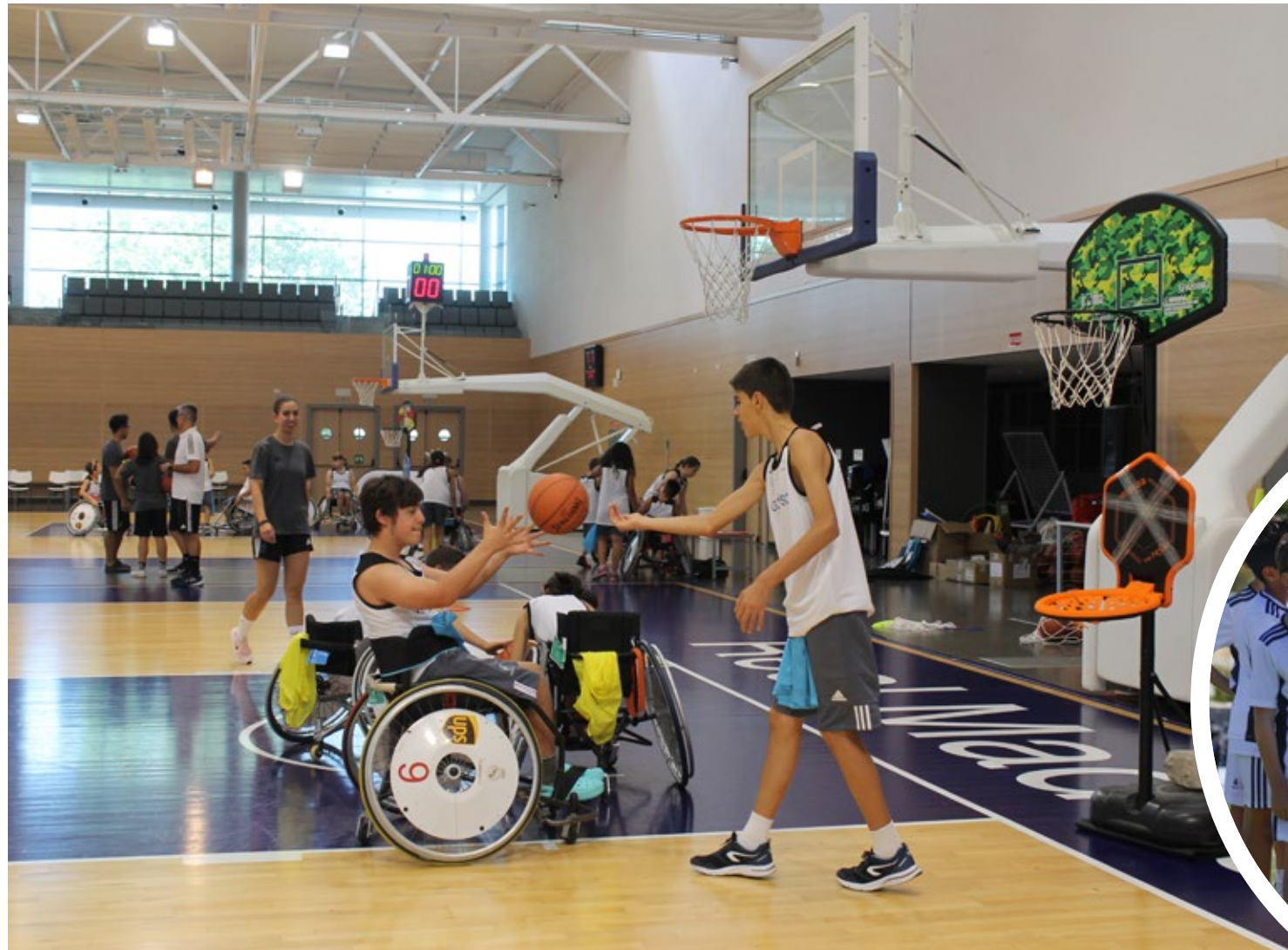
Above, participants in the Basketball, Football and Responsible Gaming and Football Experience Campuses.