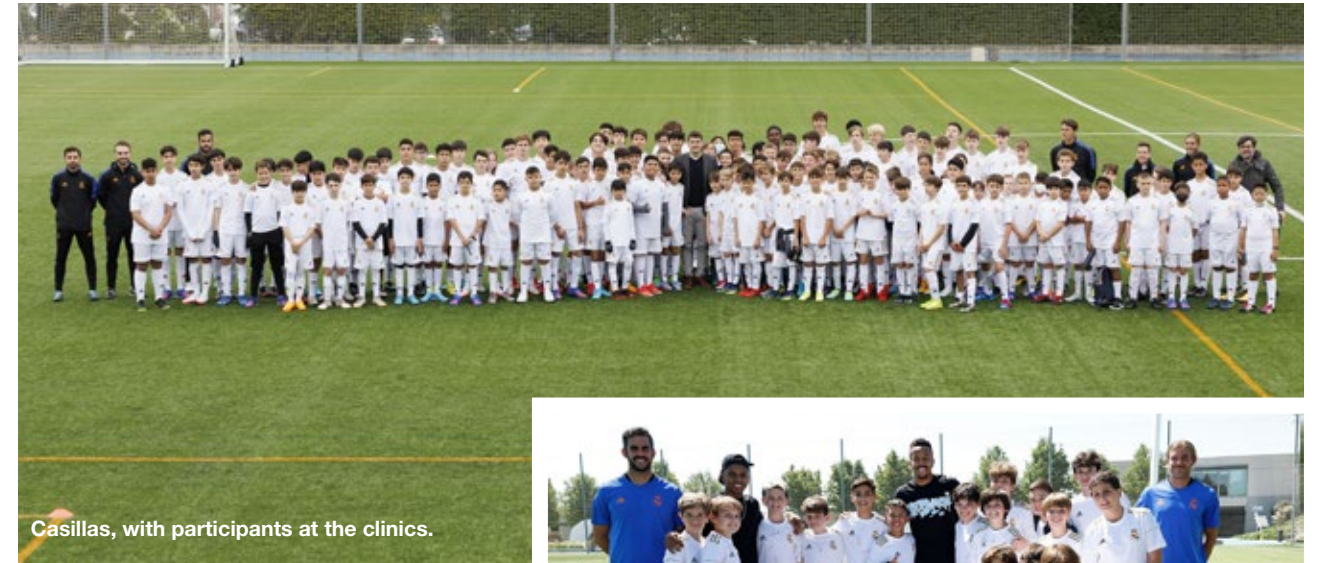
Casillas, with participants at the clinics.

A group of 134 boys and girls between the ages of 10 and 16 from IES-SEK schools in Ecuador, Costa Rica, Colombia, Guatemala, South Africa, United Kingdom, the US, the Dominican Republic, Paraguay, and Chile participated in a week-long clinic organized by the Real Madrid Foundation. Iker Casillas,