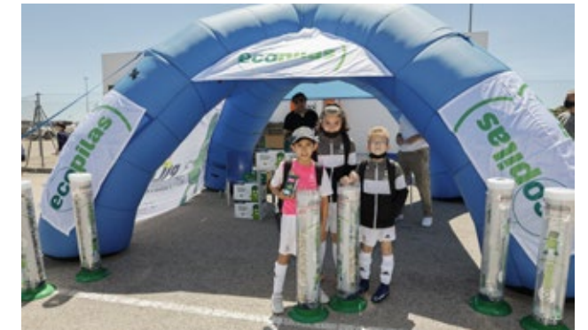
Students from the social sports schools participate in Ecopilas' massive battery collection at Real Madrid City.

each season more than a hundred socially disadvantaged children can attend the social sports schools in Segovia and Seville. ♡»