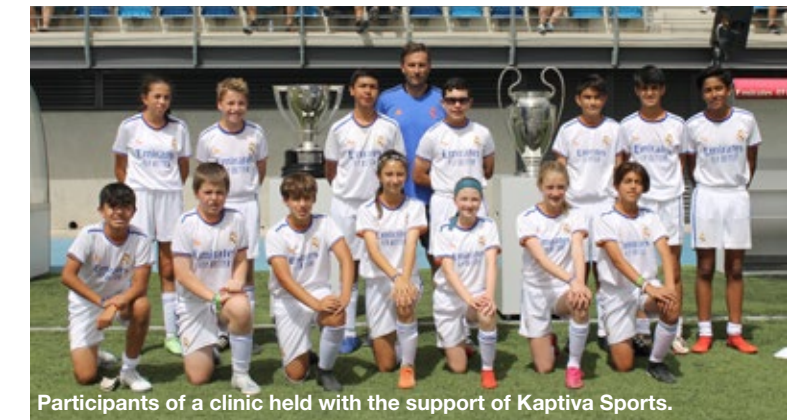
Participants of a clinic held with the support of Kaptiva Sports.