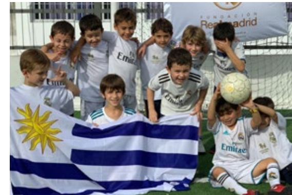
Beneficiaries of the Montevideo school.