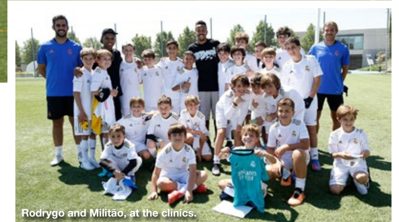
Rodrygo and Militão, at the clinics.

The Real Madrid Foundation clinics are an educational experience for technical improvement. They combine the Foundation's own teaching methodology for education in values during training sessions with the technical-tactical basis of the Real Madrid youth team. The Real Madrid Foundation coaches teach their students through the practice of sports healthy habits on and off the field, how to improve their own skills and enjoy a truly unique experience. ♡