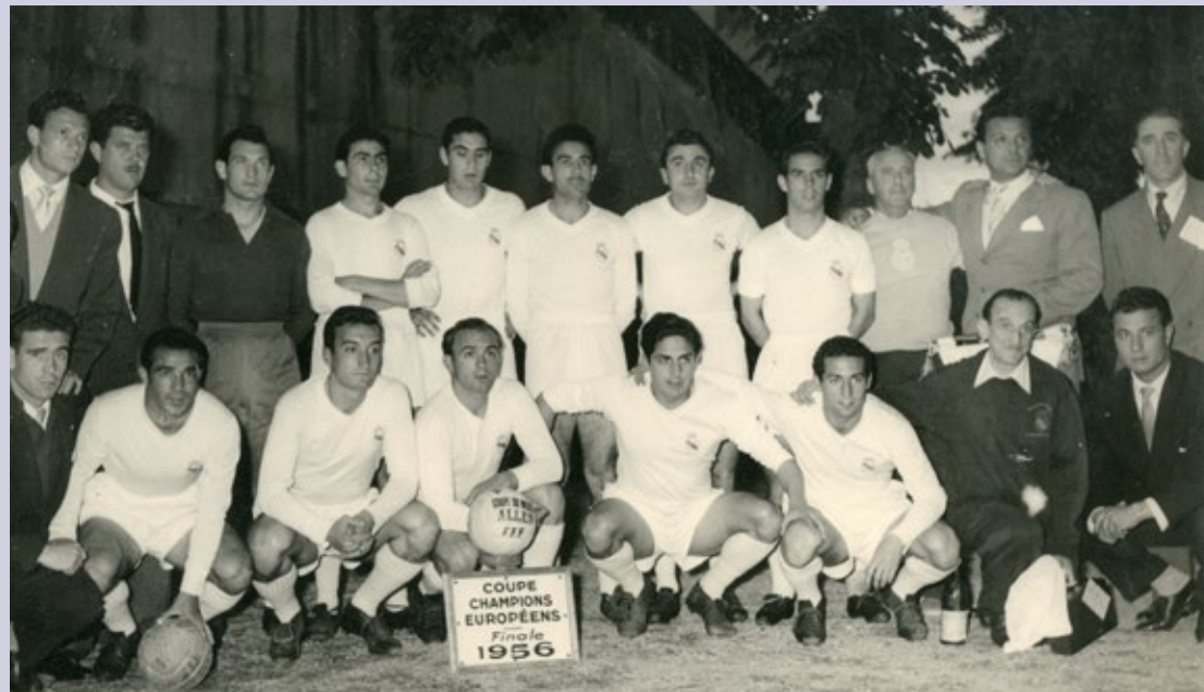
Real Madrid won the first European Cup in 1956 at the Parc des Princes in Paris with a legendary team. Below, the team's 14 European Cups.

Europe's most successful club, with 14 trophies, started forging its crown at the very beginning of the continental competition, and the club played a major role in its creation