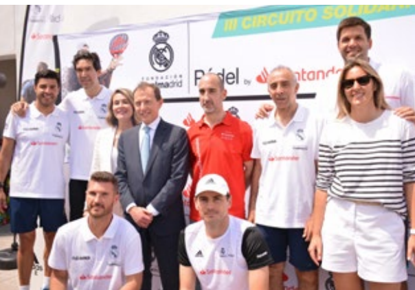
Former Real Madrid players and paddle tennis players from different collaborating companies gathered at Mad4Padel.

The Real Madrid Foundation's Charity Paddle Tennis Circuit by Santander consists of eight tournaments: Madrid (Reebok Sports Club La Finca - Pozuelo de Alarcón, June 10-12), Cáceres (Real Club de Cabezarubia, June 25-26), Almería (Centro Deportivo Roquetas 360, June 29-July 3), Mijas (Club de Pádel Cerrado del Águila, August 5-7), Madrid (Duet Sports Las Rozas, September 9-11), Murcia (Club Padel Nuestro, September 23-25), Córdoba (Real Aeroclub de Córdoba, October 7-9), and Mallorca (Rafa Nadal Academy, October 14-16). The national scope means all fans can have the opportunity to participate and win the charity circuit. More information at www.padelfundacionrealmadrid.es ↔