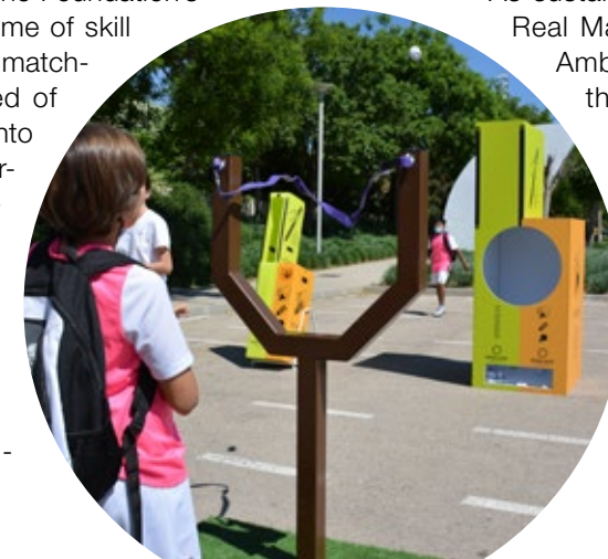
A child participates in Ambilamp's skill game for recycling light bulbs.

As sustainable institutions, the Real Madrid Foundation and Ambilamp jointly promote the achievement of the Sustainable Development Goals (SDGs) and follow ESG criteria. ♡»