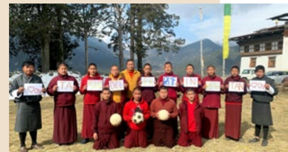
Some of the beneficiaries of the Gangteng Buddhist Monastery's social sports school, who are the youngest novices.

with the Tintefish association, aims to use football in values as a tool for educational recreation and physical well-being. The beneficiaries come mostly from low-income families and will also receive extra meals and participate in workshops on health and healthy habits and in educational and social activities. ❖