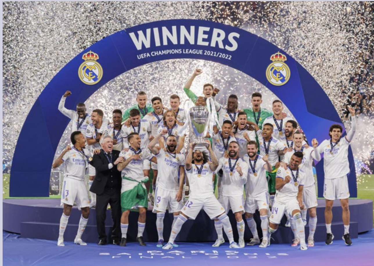
The team celebrates winning its 14 th European Cup in Paris.

consecutive victories and of its legend in European competition.