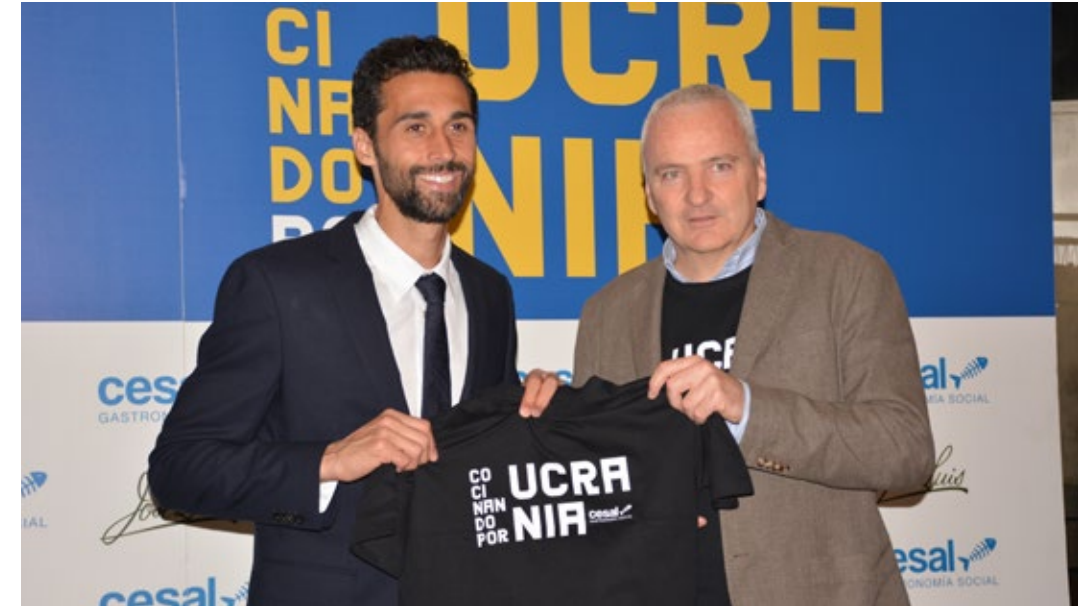
Álvaro Arbeloa y el chef José Andrés muestran su apoyo a la iniciativa 'Cocinando por Ucrania'.

La colaboración de HSBC con el programa de centros de acogida e internamiento de menores se focaliza especialmente en el centro Casa de Campo, si bien beneficia de manera directa a 359 menores tutelados por la Comunidad de Madrid. ❖