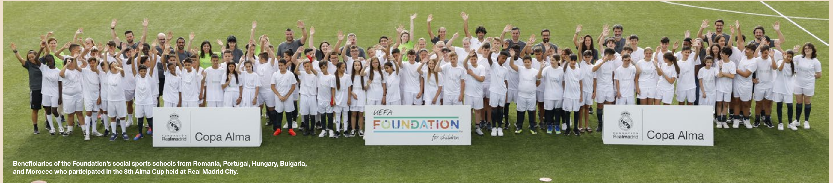
Beneficiaries of the Foundation's social sports schools from Romania, Portugal, Hungary, Bulgaria, and Morocco who participated in the 8th Alma Cup held at Real Madrid City.